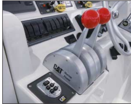
Slim Line Control Head