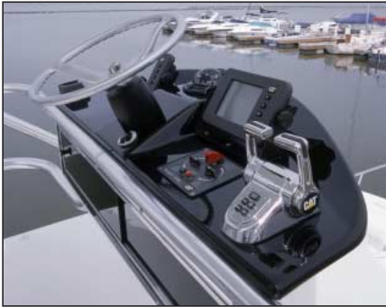
Integrated Control Head